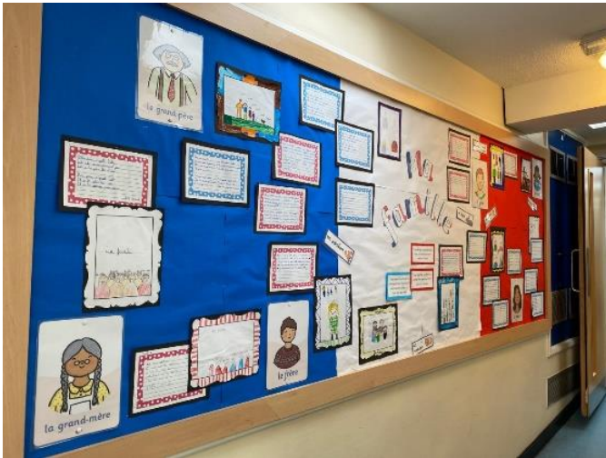
Year 4 shared information about their families at home with their classmates.