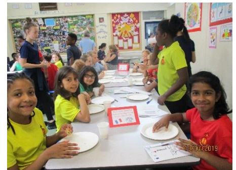
The whole school (along with parents) experiencing a 'French Café' hosted by the Year 6 children.