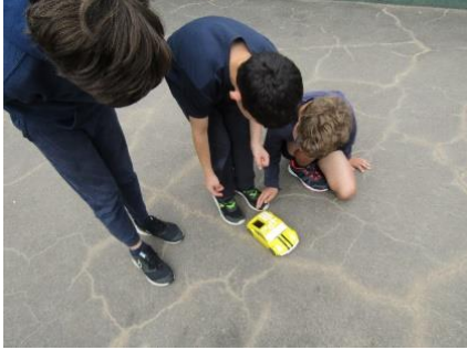
Year 6 children using Bee Bots to explore directions.

French is assessed throughout lessons by the teacher and this assists in planning for future lessons. Children review previous concepts throughout the year and topics are reviewed by the teacher at the end of each term to allow for gaps to be identified. Language is also implemented throughout school, with display materials labelling classroom objects and the French curriculum being revised with the class teacher out of French lessons.