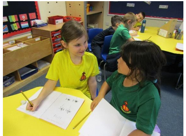
Year 3 children practising greeting each other and introducing themselves.